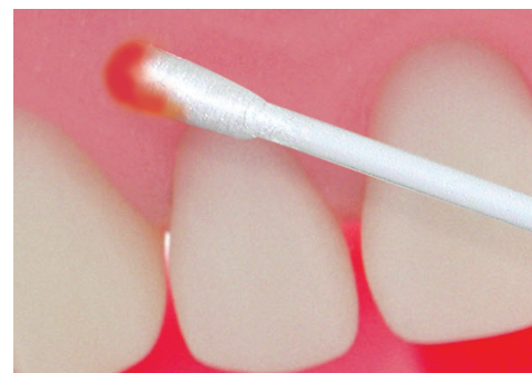
Easy, rapid-onset, application