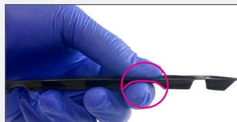
3. Secure, comfortable finger grip – no slipping.