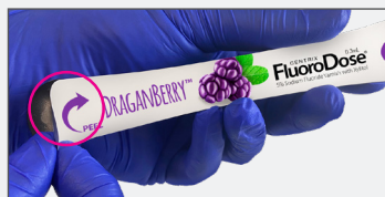
1. Smooth, easy peel.