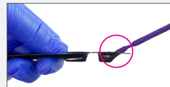
4. Angled well removes excess material.